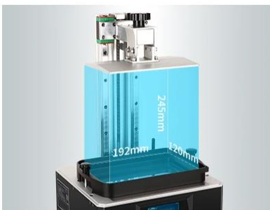
Large Build Volume