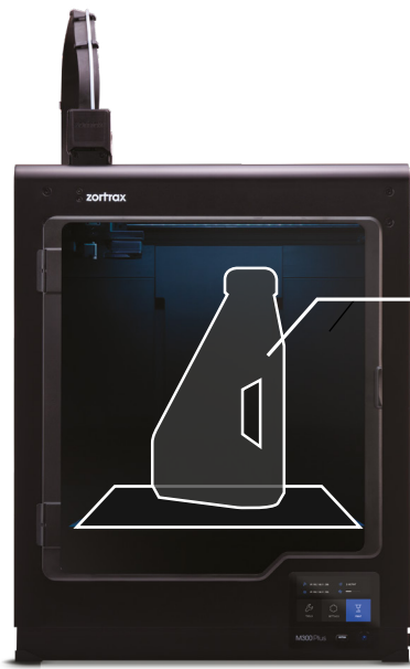
Zortrax M300 Plus 3D printer