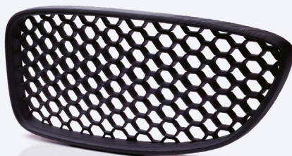
Car grille prototype